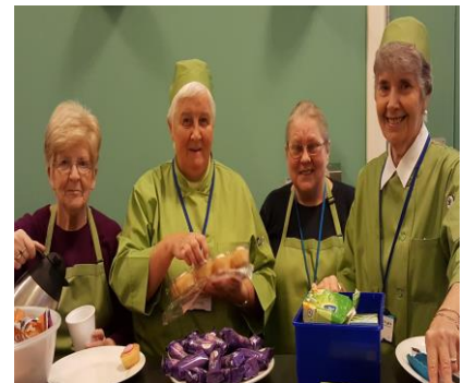
The Soup Pot team get ready to welcome our service users.