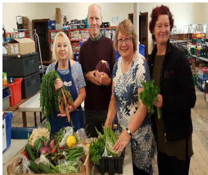
The foodbank team accept a donation of fresh Produce from The Tullibody Healthy Living initiative.