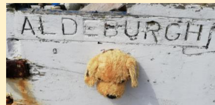
Aldeburgh, July 2019