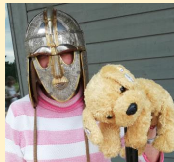
Suffolk, May 2019