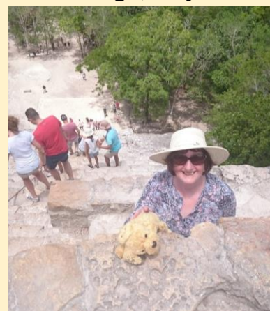
Mexico, June 2019