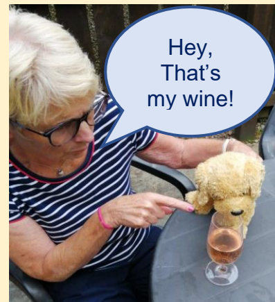
Aviemore, August 2019